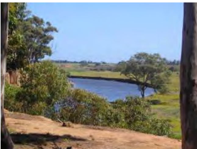
Looking over the Werribee River estuary toward the new Werribee Regional Park

Parks Victoria will develop a Friends group for the new Werribee Regional Park that is soon to be opened. The project received $40,920 for training and revegetation works. Similar 'Friends' programs at neighbouring properties have attracted extensive support, with Werribee Open Range Zoo attracting more than 150 volunteers and the State Rose Garden attracting over 100.