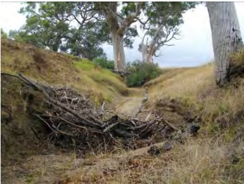
Little River revegetation project – One of the photo points along the river

Vision for Werribee Plains has contributed $49,000 towards the project. Key stakeholders include Melbourne Water and individual landholders, and will see most of the river fenced off between the Brisbane Ranges Park and the Geelong-Bacchus Marsh Road.