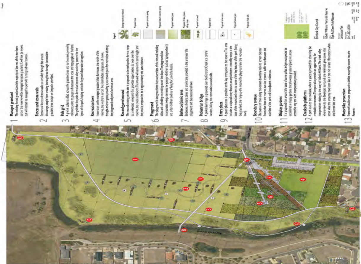
Isabella Williams Memorial Reserve, with Kororoit Creek in the foreground

The project has been supported by Vision for Werribee Plains with funding of $14,500 in a $60,000 project and is being implemented by the Shire of Melton and Toolernvale Landcare Group.