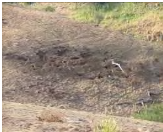
Werribee Gorge (above left)

Vision for Werribee Plains is contributing $139,000 to the project's $600,000 total cost, with Melbourne Water Corporation being the other major contributor of funds. The project will be overseen by the Port Phillip and Westernport Catchment Management Authority's Grow West group. Parks Victoria and Conservation Volunteers Australia who manage properties adjacent to the project area will also provide support.