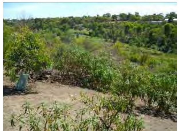
Looking NE across Kororoit Creek to the site of a new shared walking/cycling trail in Altona North

The Altona North shared trail has received $20,000 support to match an investment by the City of Hobsons Bay and Parks Victoria. The trail will go along Kororoit Creek between Geelong Road and Barnes Road and will eventually replace the current informal trail. Local residents are keen for the trail to be constructed to provide an alternative to vehicular traffic in an area criss-crossed by numerous major roads and will provide a valuable link for the community and its facilities.